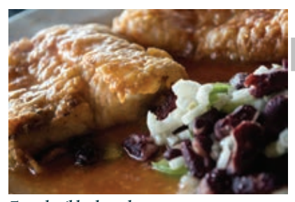
Espada (black scabbard fish), a Madeirense specialty.

Madeira bottles should be stored upright, and the wines served at cellar temperature or just above. Because they keep for decades, there's no need to decant them nor to drink them in single sittings; indeed, given their generous aromas and alcohol levels, smaller pours are appropriate (D'Oliveira's preferred Madeira glass has a line at the 1.3-oz. mark). "We currently have about 40 different labels by the glass and three vintage flights," Scaffidi reports. "You can serve a glass from 1912 and be at ease that the opened bottle will not lose texture, complexity, or flavor. It's a total win for profit and increases vintage depth; it also comes in handy for guests who want the grand finale to be from the year they were born."