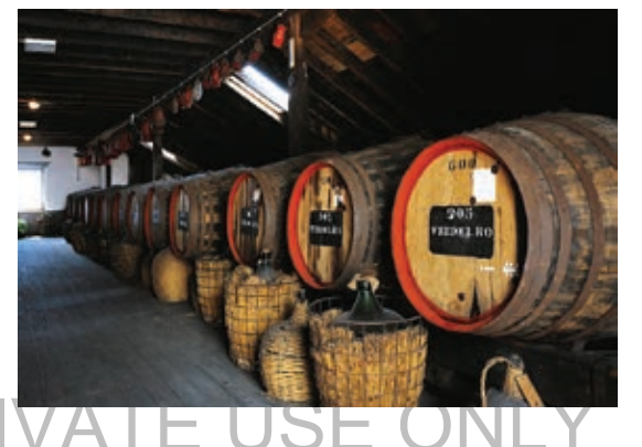
varieties, the palate-busting drier styles—Sercial, Verdelho, and Terrantez-routinely astonished us with their verve and complexity.